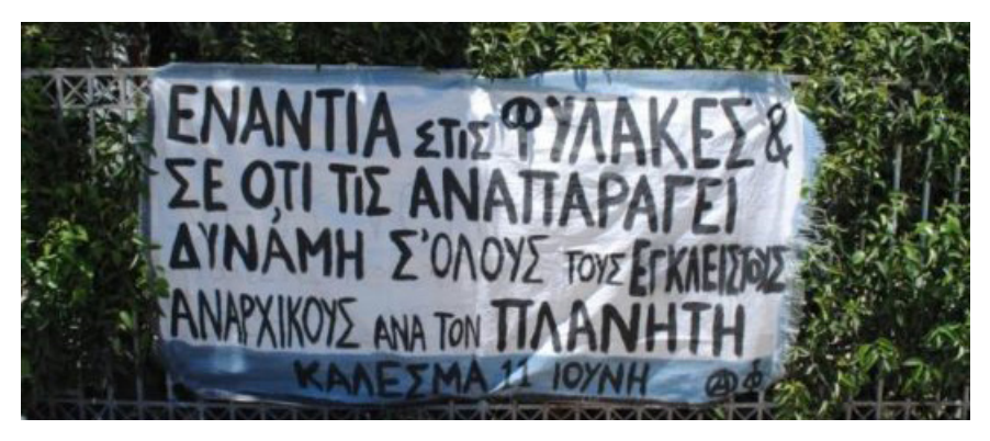
"Against prisons & everything that reproduces them — Strength to all incarcerated anarchists across the planet — June 11th Callout"

June 11th graffiti and banners by the anarchist group Wild Nature; against every type of incarceration; for the support of imprisoned anarchists throughout the planet.